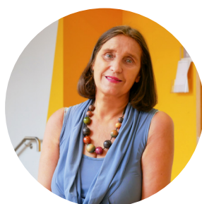
Original Study Skills Programme Booklet & materials provided